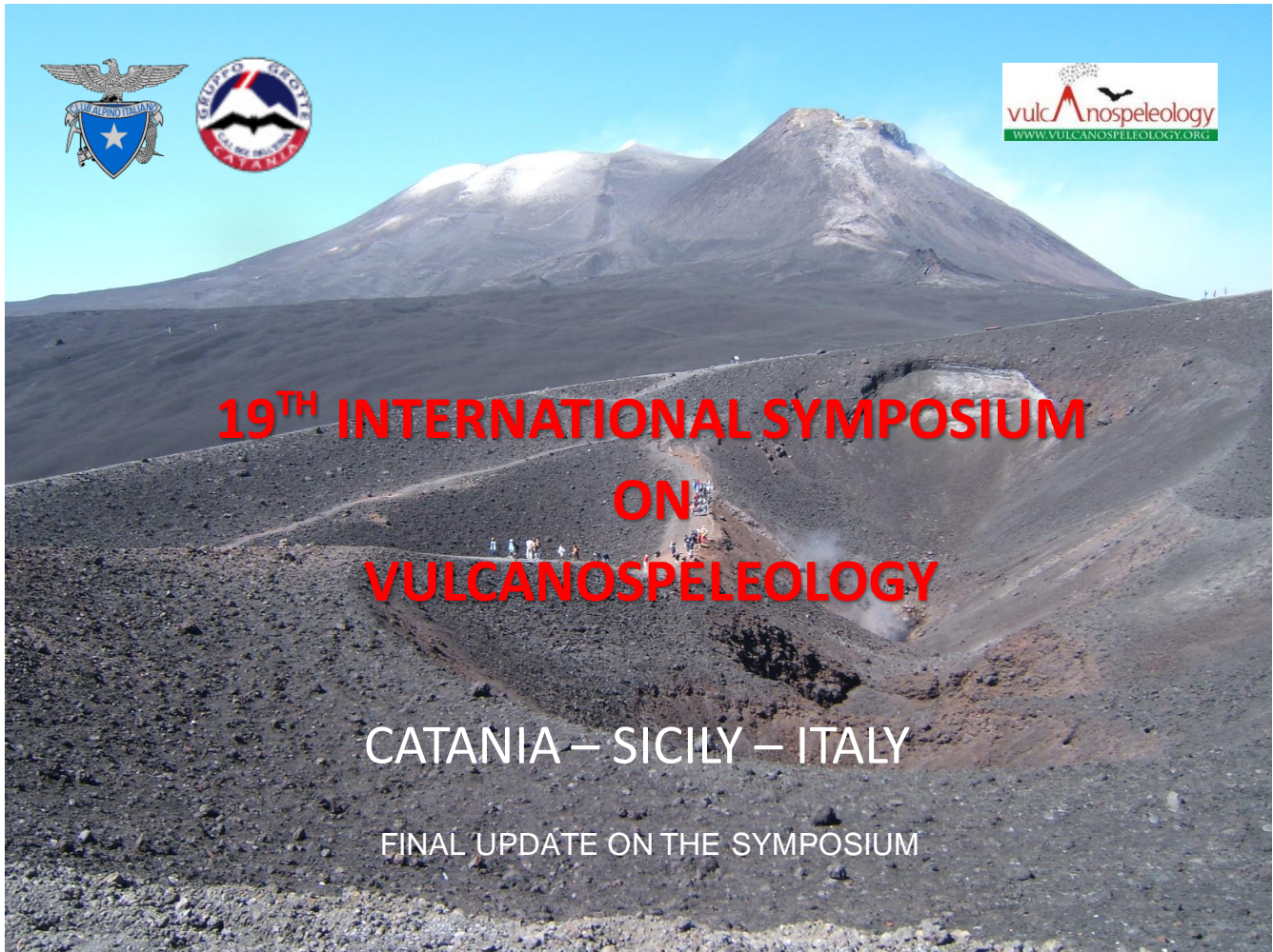
Figure 1: Etna's summit craters from Barbagallo craters

Dear participants to the 19th Symposium on Volcano speleology, greetings to all of you, waiting to say hello in person in Catania. Here is some important updates for you