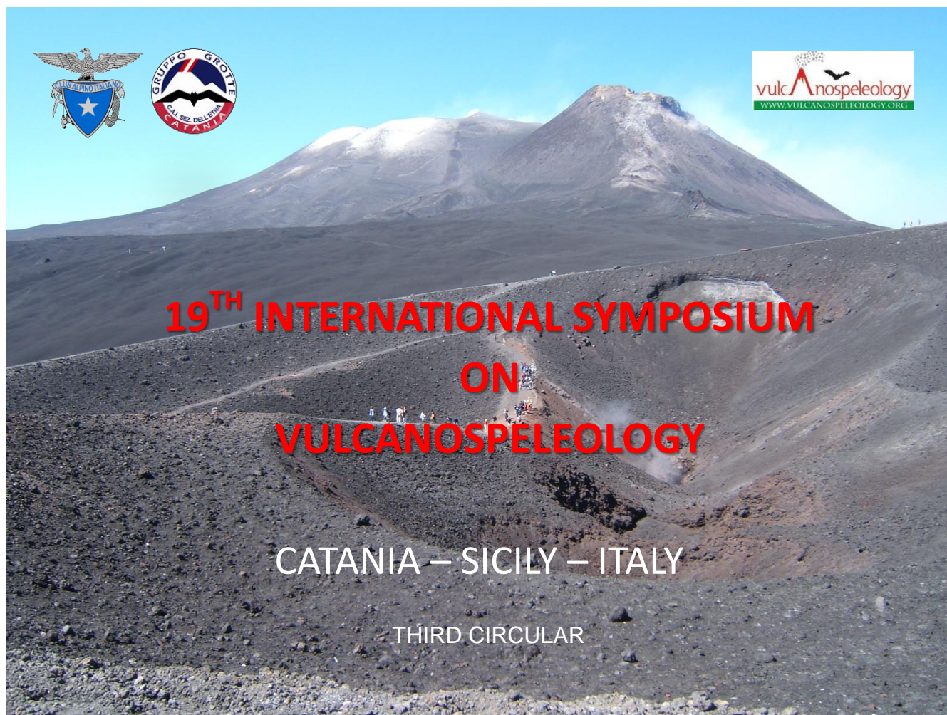
Figure 1: Etna's summit craters from Barbagallo craters