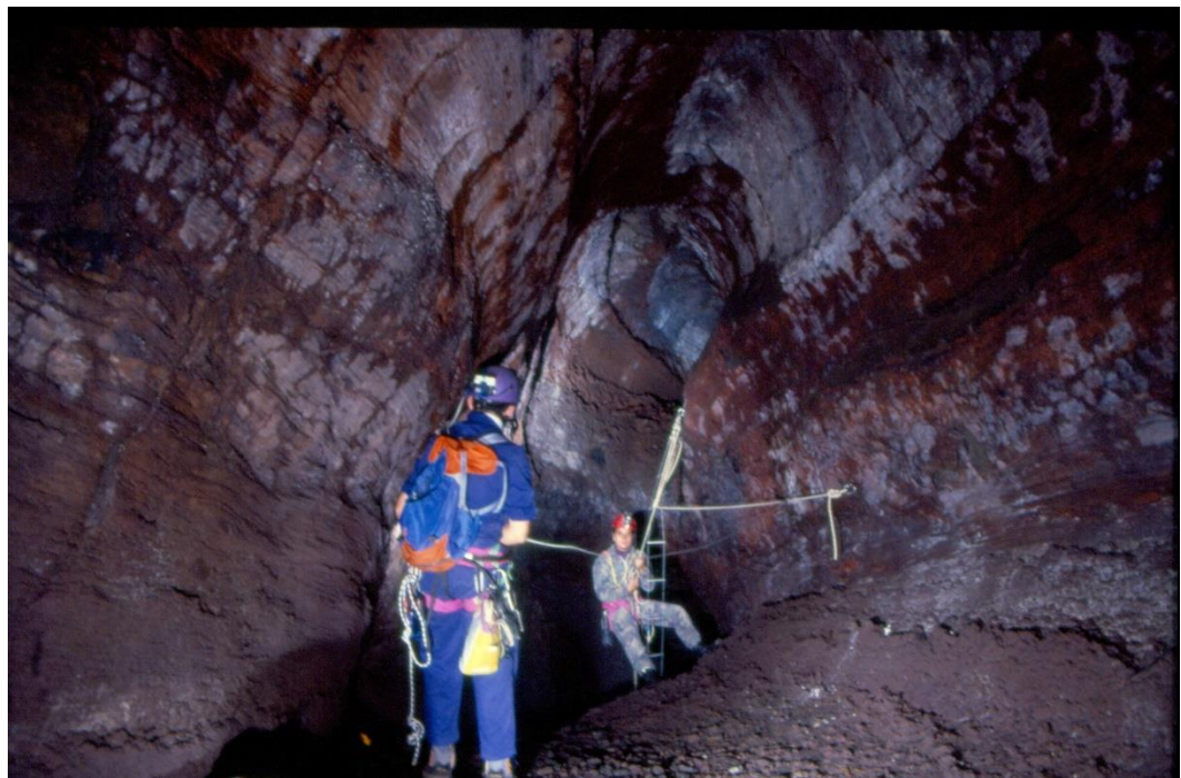
Figure 2: Tre Livelli Cave, from first level to the second

Finally, near the town of Catania there is an area in which some simple caves have been prepared for a didactical tour (Grotte di San Gregorio). The access to that area is possible to all participants and is included in the cultural heritage program.