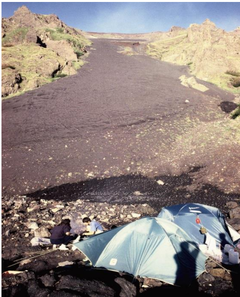
Figure 13: Valle del Bove, 1996 exploratory expedition.

This camp will not have a maximum limit on the number of participants and activities to be carried out will be agreed on day by day on the basis of the technical skills and experience of the participants themselves. Participants will be accompanied to the camp on Saturday September 4 th and will be driven back to Catania in the late afternoon of Thursday September 9 th .