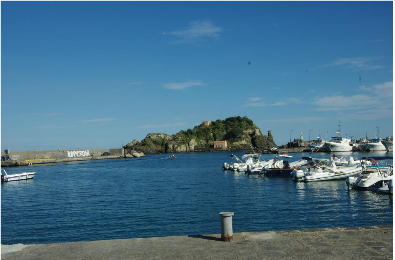
Figure 3: Acitrezza port, in background the Lachea island

Participation on some visits could be limited due to logistic reasons; entrance to museums or monuments is to be paid on site and an extra fee might be required to cover transport outside the town.