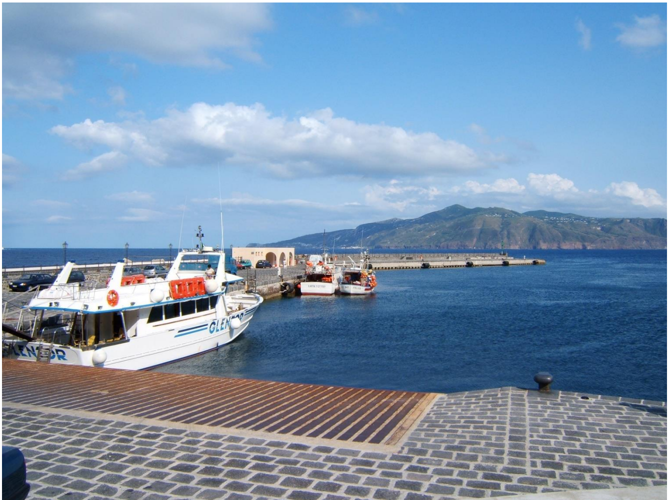
Figure 4: Eolie islands

The cost of this excursion will be subject to an adjustment due to anti-covid restrictions; the exact fare will be communicated in the next circular.